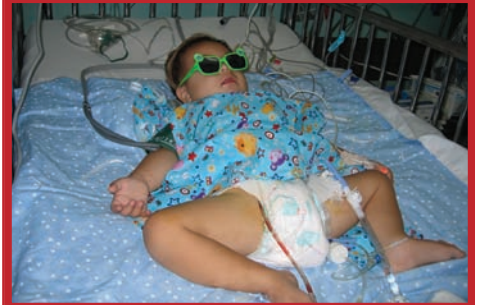
Postoperative Open Heart