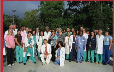
Medical volunteers in El Salvador