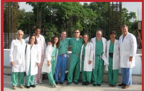
Medical team from Montefiore/ Einstein